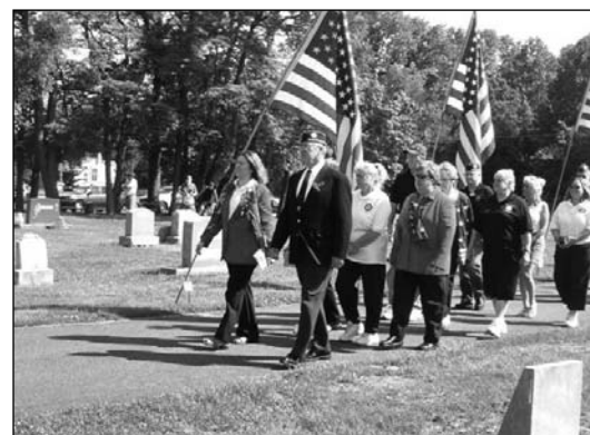
Post 281, Unit 281 & Squadron 281 members take part in Memorial Day ceremonies.

Don't forget to check our website for the latest information: http://www.njlegionpost281.org